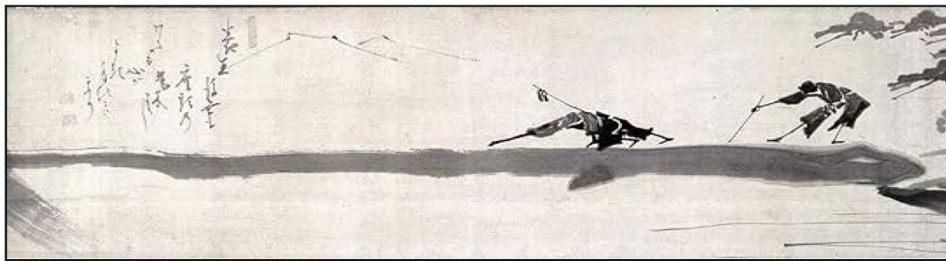
Hakuin Ekaku (1686-1769), Two Blind Men Crossing a River

Towards the end of his life, the great Zen Master Hakuin (1689-1769) (self-portrait below left) took an increasing interest in life outside the monastery and in the lives and practices of his lay disciples, government ministers and the aristocracy.